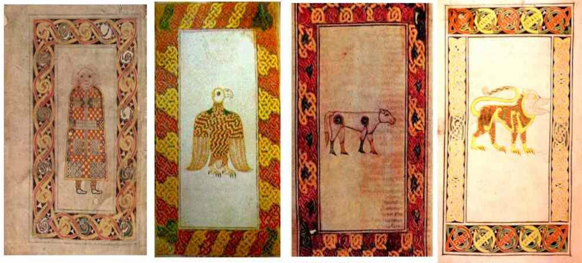
The Man symbol of Matthew Folio 85v